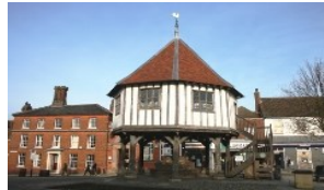
The market cross