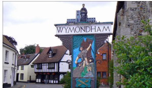
Wymondham town sign

Despite these treasures Wymondham came close to a completely fresh start, architecturally speaking, in the 17th century. A fire swept through the centre destroying many buildings. Three travellers and one local woman were blamed for the blaze and they met a predicatably miserable end as a result. It has been estimated that over 300 people lost property or belongings on that day and as a result the centre of Wymondham is slightly lacking in buildings from before this period. However this meant that the town had space for a bit of a building boom and now contains many fine Georgian buildings as a result.