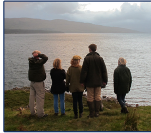
Not a bad view! Looking towards the Isle of Mull during a trip to Scotland last week