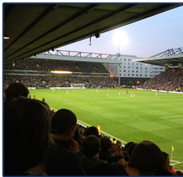
Norwich City v Arsenal – and the Canaries' first league win of the season